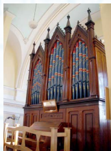
The organ before and after its restoration